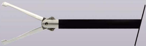
Ref 400-1145 (Fenestrated Babcock Forceps + impugnatura ergonomica monopolare, 5mmx330mm) (Fenestrated Babcock Forceps + monopolar ergonomic handle, 5mmx330mm)