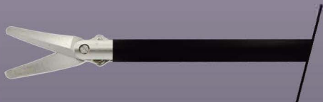
Ref 400-5125 (Curved Scissor+ impugnatura ergonomica monopolare, 5mmx330mm) (Curved Scissor + monopolar ergonomic handle, 5mmx330mm)

*Confezioni di vendita: Blister singolo, sterile, in scatola da 5 Pz. Sales packaging: Single sterile blister in box of 5 pcs.