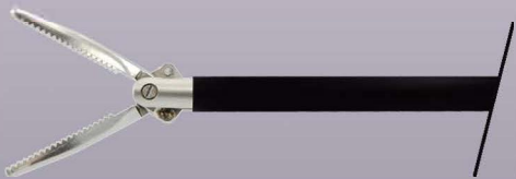
Ref 400-2135 (Maryland Grasper + impugnatura ergonomica monopolare, 5mmx330mm) (Maryland Grasper + monopolar ergonomic handle, 5mmx330mm)