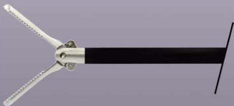
Ref 400-3145 (Atraumatic Grasper + impugnatura ergonomica monopolare, 5mmx330mm) (Atraumatic Grasper + monopolar ergonomic handle, 5mmx330mm)